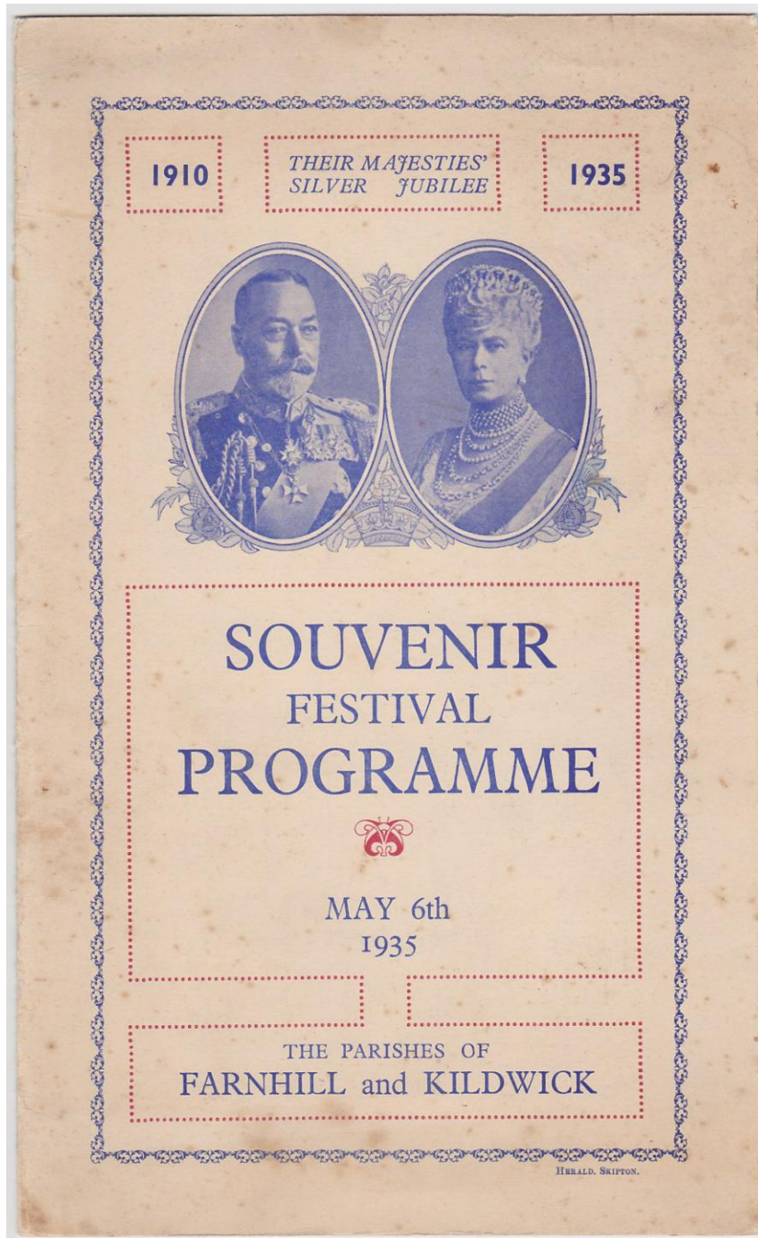
Figure 1: The Kildwick and Farnhill Souvenir Programme front cover – with the names of the two villages printed the wrong way round by the Craven Herald

The following pages will use the programme details to guide us through the events held in the two villages on May 6 th 1935.