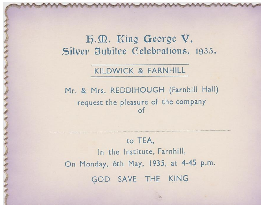
Figure 4: An invitation to Tea